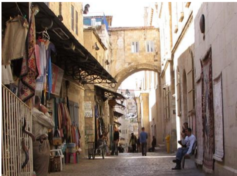
Ecce Homo Arch, Via Dolorosa (near 2 nd station).

Calendar Deacon's Corner Lectionary & Vestry Notes Rotation Schedule St. Stephen's Children Money Matters LAS Forum & Fun Series